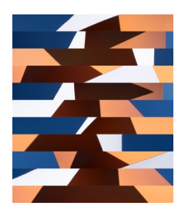
48 x 41 dye sub on aluminum edition of 9 $5500