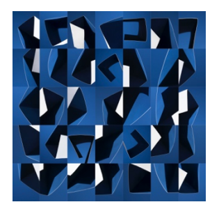
48 x 48 dye sub on aluminum edition of 9 $5500